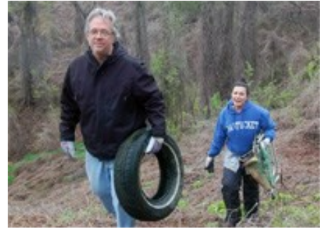
Clearing out "Jurassic Valley" in South Side Park for Earth Day.

In celebration of Earth Day, volunteers came together again on April 25 to pick up litter, as well as clear out invasive vines and weeds in South Side Park.