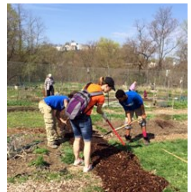
Teamwork in action....students enjoying the great weather and mulching garden pathways .

Official kickoff of the gardening season begins on Planting Day, scheduled for May 16 from 10 a.m. to 2 p.m. Stop by anytime throughout the year and take a stroll through the garden to see the progress. Visit: www.bandischaum.org .