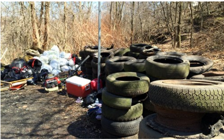
Stacks of tires, piles of garbage cleared from Knoxville Incline Park.

volunteer hours were logged as students from CMU, South Siders and friends converged on Knoxville Incline Park and Brosville Street to haul out of the woods, hillside, and sidewalks. More than 100+ bags of trash, 125+ tires, including random garbage such as a shopping cart, pieces of a toilet, more than 30 phone books, and several rolls of carpet padding, among various other things.